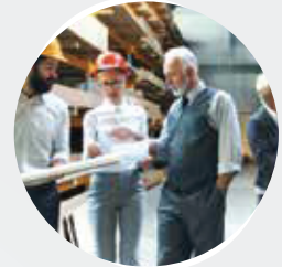
Facility Management Services