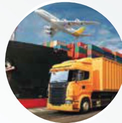
Transportation & Logistics Sector